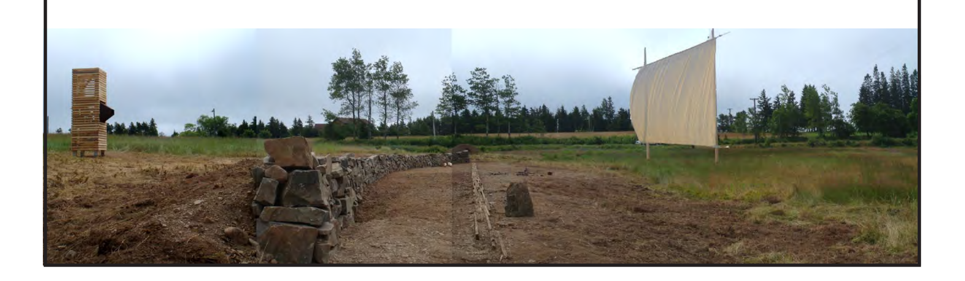
Screen as Mast