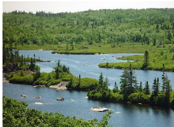
Cranberry Lake as seen from The Bluff Trail

Fourth , these public lands offer unique opportunities for recreation and eco-tourism within an urban context, including: (a) The Bluff Wilderness Hiking Trail, (b) a large network of canoe/kayak routes consisting of some twenty lakes, streams, and rivers, and (3) traditional hunting and fishing.