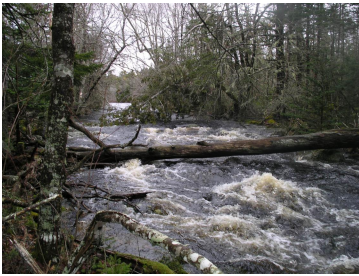
Spring flow on the Woodens River

Unfortunately, these values and the vision of the future that they make possible are in jeopardy because of the great pressure for residential and commercial development and the current lack of effective protection for this valuable area, which can best be provided through the Wilderness Areas Protection Act. The recent swap of Crown land to permit development of Moody Lake demonstrates that DNR policy that restricts such land swaps does not provide any assurance of protection against piecemeal encroachment by developers.