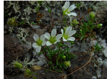
Mountain sandwort ( Arenaria groenlandica ) along The Bluff Trail.

centres experiencing rapid expansion and at the same time reap the economic benefits of increasing the value of development along the ring of Routes 103 and 333 and of the eco-tourism that this leadership would inevitably attract. In fact, when this area is combined with the other candidates for wilderness protection in HRM what emerges is the vision of the largest urban center in Eastern Canada surrounded by a green belt of protected wilderness, making it unique in North America and a model for the world with all the economic benefits that the realization of this vision would entail.