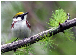
Chestnut Sided Warbler at Jerry Lawrence Park

By including these public lands under the protection of the Wilderness Areas Protection Act, the province will move closer to its commitment to protect 12% of Nova Scotia's land mass with little or no loss of potential forestry or mineral development and economic activity, since there are no valuable forestry or mineral resources in this area. More important, the province can establish itself as world leader in environmental sustainability for urban